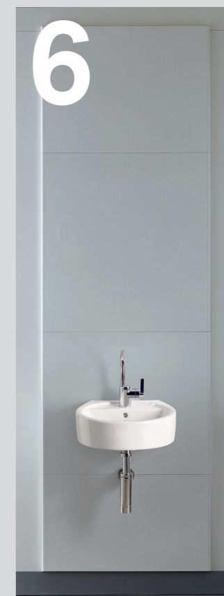
06 Simply close the hinged panel and attach the top and bottom panels of the units. Installation is complete.