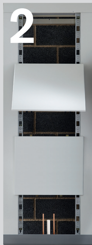
02 Click-fix the first Frameduct unit onto the frame and slide into position. Open the mid panel to a fully hinged position. Attach a vertical flashgap to the frame on either side of the unit, screw-fixing to the frame from the face. Fix tie back to the wall. Repeat until all units are in place.