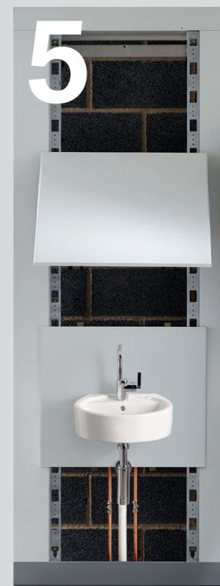
05 Once all the units are in position, connect the plumbing and services and apply silicone sealant to sanitaryware.