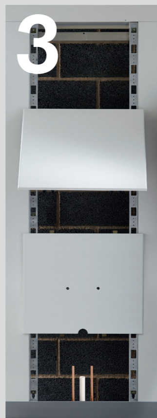
03 Drill or cut out for sanitaryware.