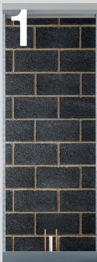
01 Once the site has been prepared, fix the aluminium docking frame to the wall, ceiling and floor.

Frameduct brings you an intelligent, great looking system that's easy to install but with an added bonus - you get to choose your own sanitaryware.