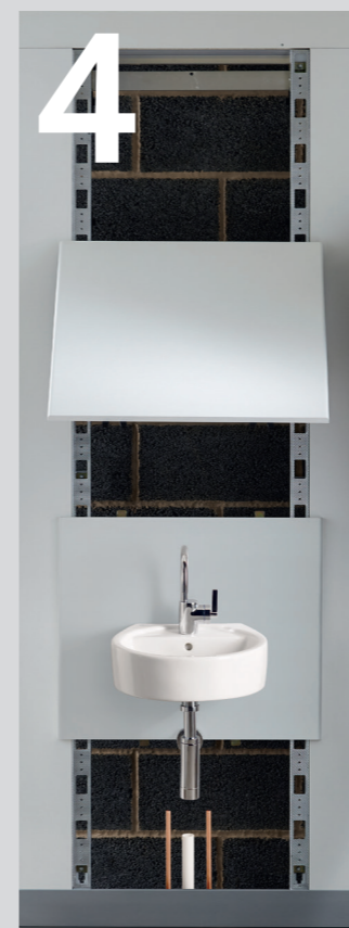
04 Mount sanitaryware and brassware.